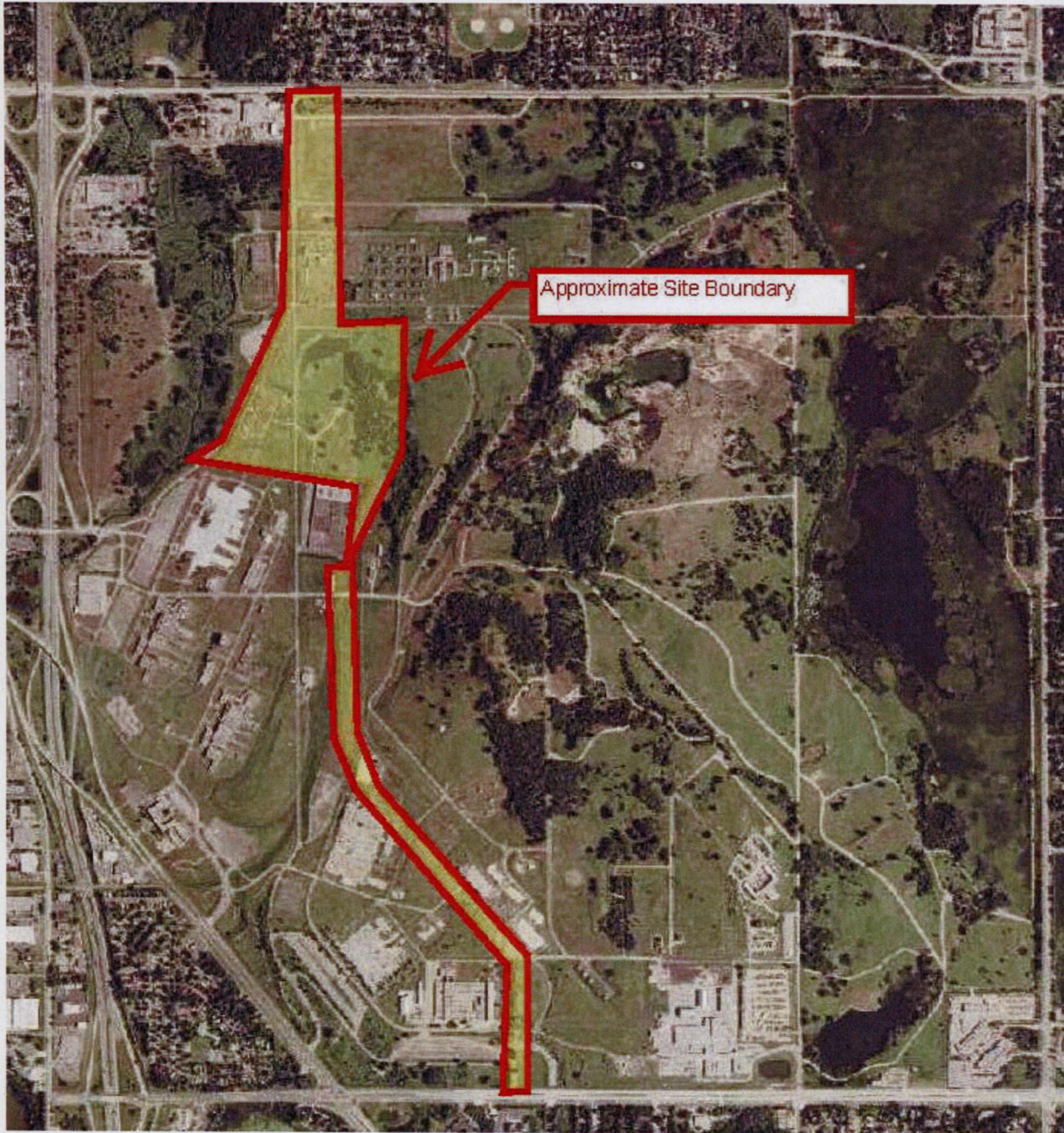
Map adapted from Wenck Associates, Inc.

Rice Creek Regional Trail Site MPCA Project Number VP 26640